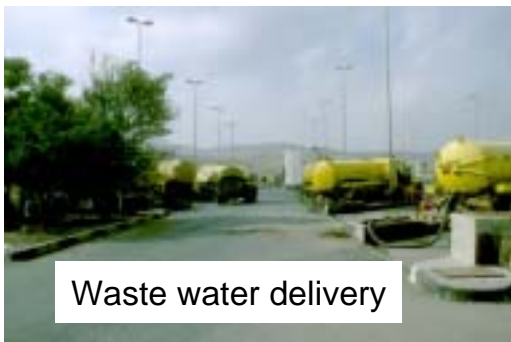
Waste water delivery